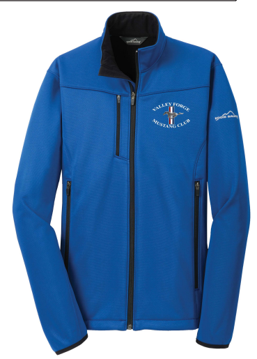
Shown above in Cobalt Blue