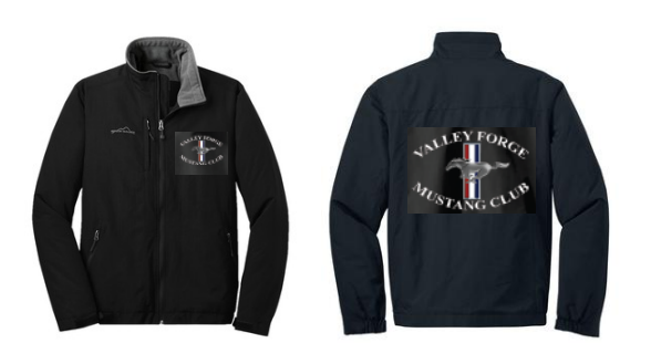
Shown Above in True Black / True Black